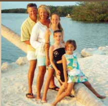
The McDulin family on vacation in Islamorada, Florida.