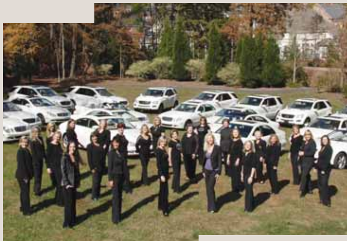
RVPs and NVPs putting Georgia on the map!