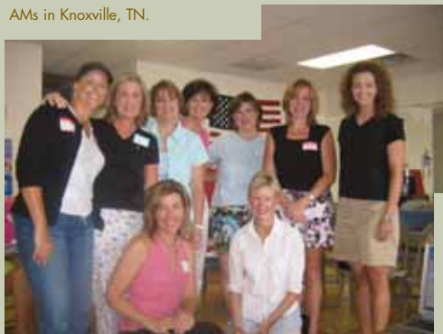
AMs in Knoxville, TN.